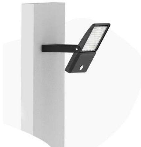
U Shape Bracket